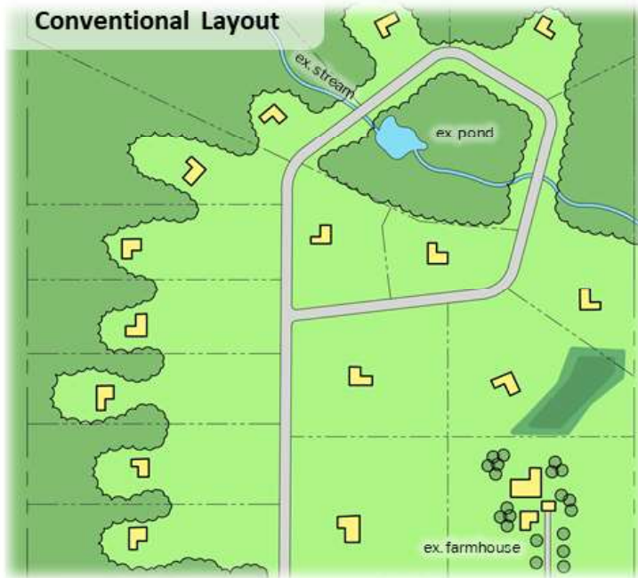
Figure 3.1: Existing conditions on a 60-acre, majority wooded parcel